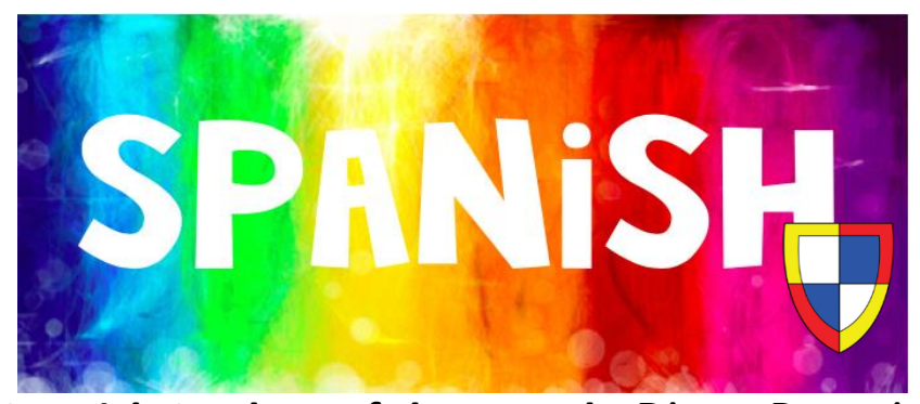
Spanish Student of the Month: Diego Pantoja

Students will be completing assessments on istation. Please encourage your child to pay attention and do their best. September 15<sup>th</sup> begins Hispanic Heritage Month. Kinder kiddos are working on short sound words, 1st grade is working on key details, 2nd through 4th grade are working on the main idea, 5th grade is working on drawing inferences from the text and vocabulary and 6th and 7th grades working on pronouns, the articles and vocabulary.